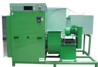
DFRA Series for typical installations

The selected dehumidifier must have sufficient drying capacity to compensate for the excess humidity brought in by the Ventilation in the given environmental operating conditions.