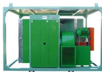
DFRC Series for temporary applications

Fisair has a wealth of experience in environmental humidity control and an extensive commercial network for after-sales technical assistance. For further information, please do not hesitate to contact us using one of the methods given below.