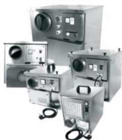
DFRB-D Series for small rinks