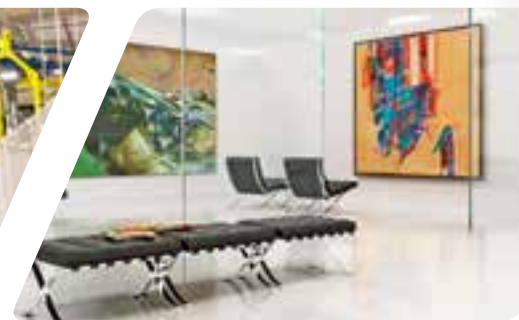
Museums and galleries