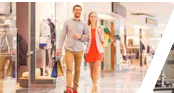
Shopping centre and department store